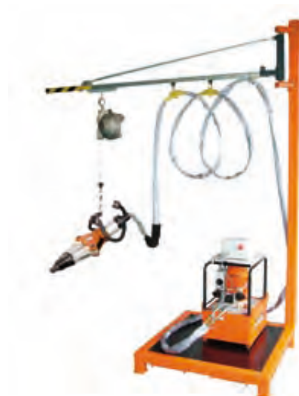
Spreader fastened to crane by means of balancer