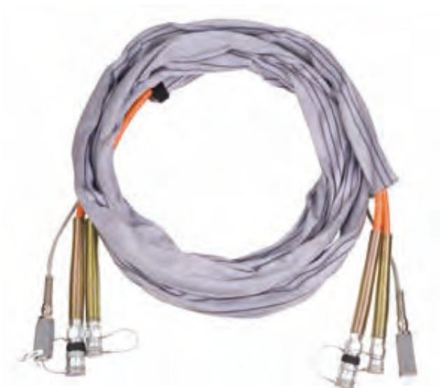
IVL 10 SOU-EK