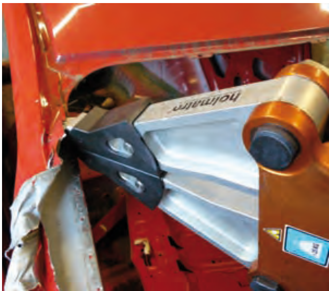
IPU-S 09 S 25 E